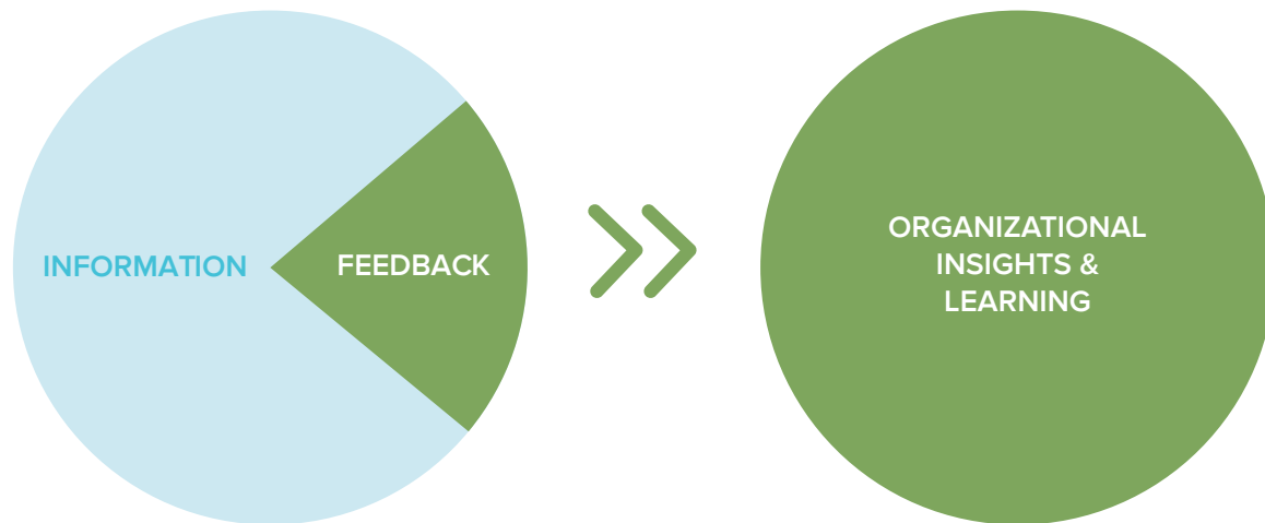
Figure 1. Feedback: one input into organizational learning

it comes to light through constituents' actions and behaviors.